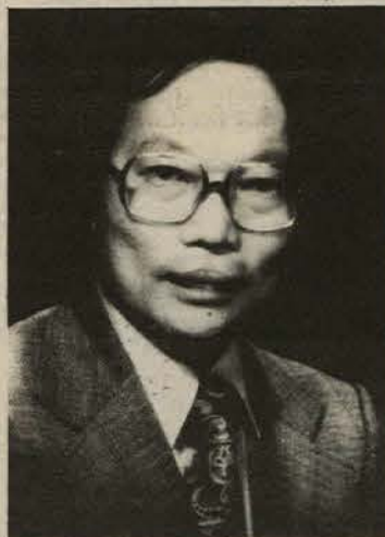
new club's President, is interested to find out from people in their territory